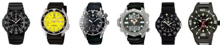
Luminox Seiko Casio Citizen Zen Headgear Torgeon

ALWAYS: All exposure to water up to and including recreational SCUBA diving. Be sure to rinse the watch with fresh water after exposure to a chlorinated pool, salt water, soaps, etc. After rinsing with fresh water, be sure to dry the exterior with a fresh cloth.